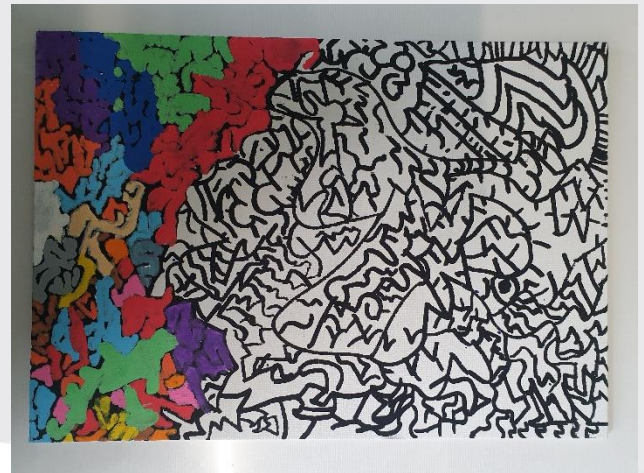
Abstract artwork by HH

Checkout some of the amazing artwork created last month